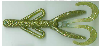
Bonsai Hog- 8 pack $4.75