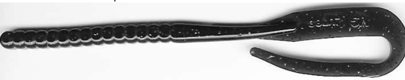
10" worm (curl tail) - 10 pack $4.25