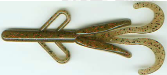
Baby Bonsai- 10 pack $4.25