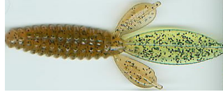
Rhino Beetle- 5 pack $2.25 Rhino Beetle- 10 pack $4.50 Rhino Beetle- 50 pack $21.25 Rhino Beetle - 100 pack $40.00