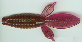
Baby Beetle- 10 pack $3.75 Baby Beetle- 50 pack $16.75

Appendages for wiggling, shaking action.