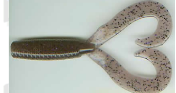
4.5" twin tail grub - 10 pack $4.25