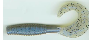
3.5" curl tail grub - 10 pack $3.25

Fully rounded grubs that are great as a spinnerbait or swim jig trailer.