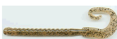
5" worm (curl tail) - 10 pack $3.25